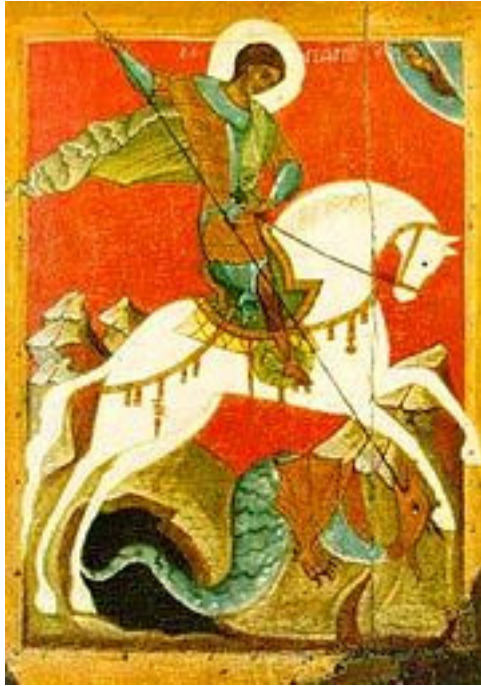
St George, Patron Saint of England