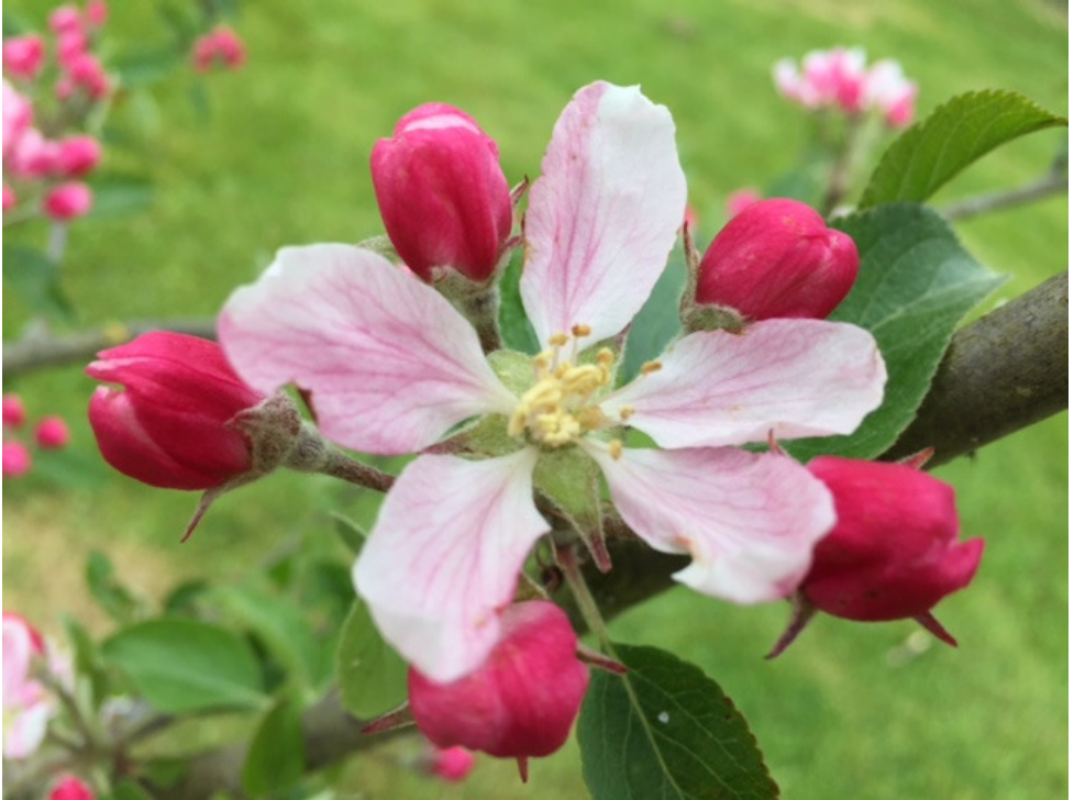
Apple blossom May2017