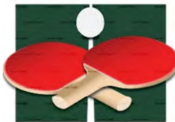
Table Tennis- Friday