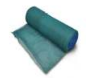
Debris netting & scaffold sheeting.