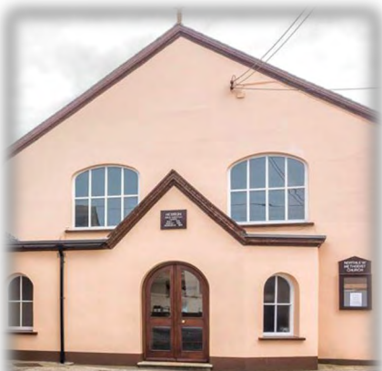
The Methodist Church